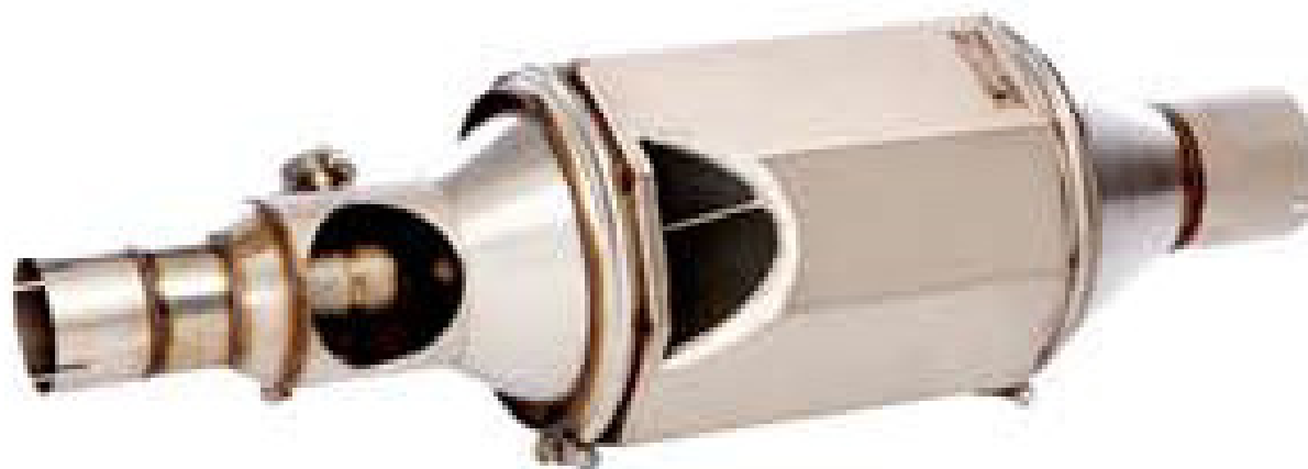
Cleaire Vista™ Active Diesel Exhaust Filter