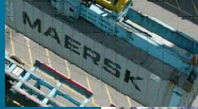
Case Story Four ships with SCR