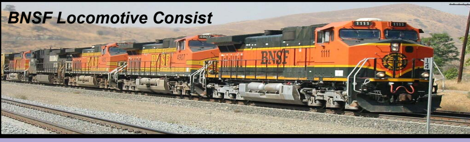
BNSF Locomotive Consist